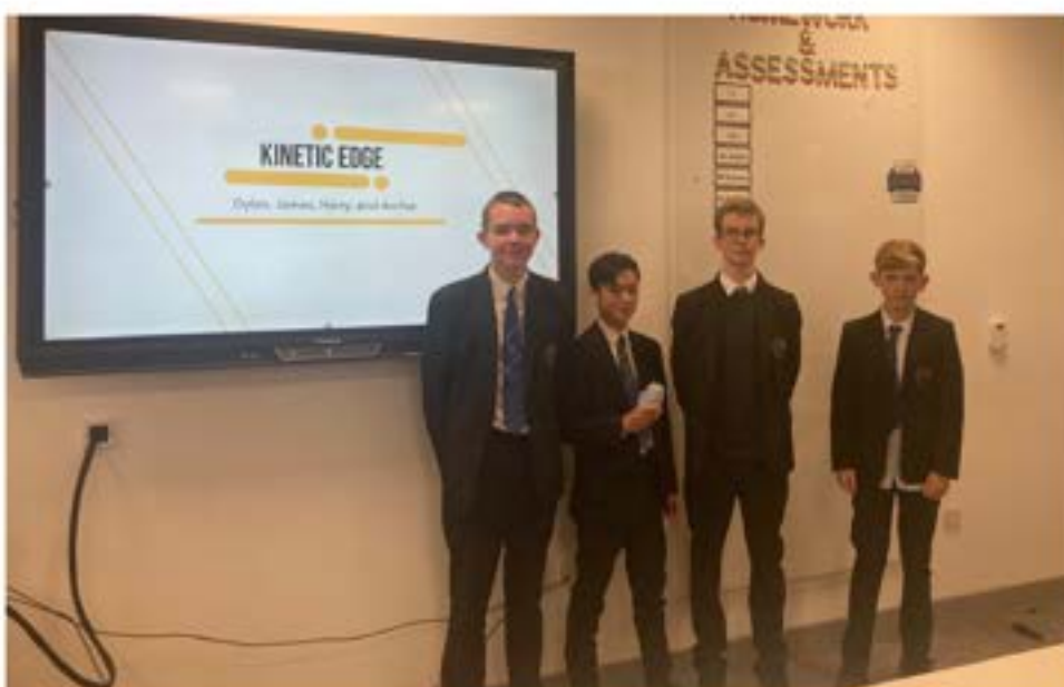
Kinetic Edge had the best pitch - so proud of you!