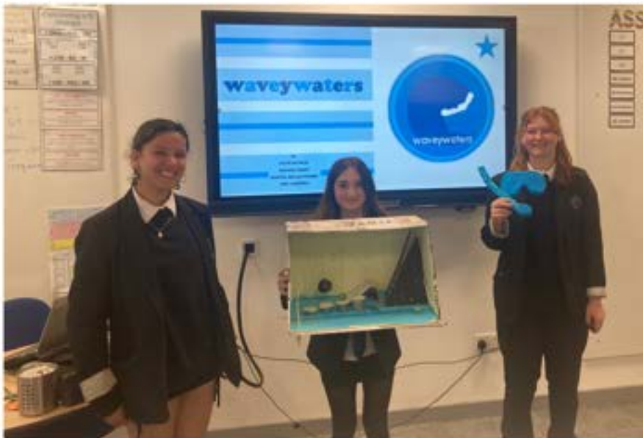
Wavey Waters were the overall winners - Congratulations!

S2 classes spent 4 weeks taking part in the Dragon's Den project. This involved coming with a unique business idea, creating a prototype and developing a presentation including elements of the marketing mix. The classes presented their PowerPoints and a winner from each class made it through to the final. The effort and engagement from all pupils was incredible. Well done to Wavey Waters from 2.7 who were the overall winners. Well done to our S2 Dragon's Den winning teams.